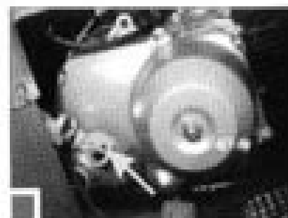
ENGINE OIL DIPSTICK