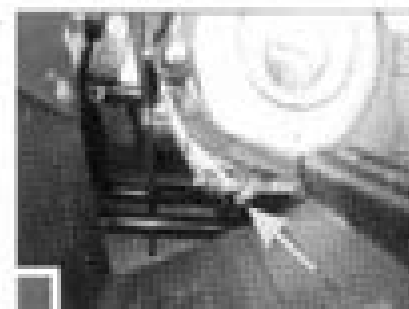
OIL DRAIN OUT SCREW