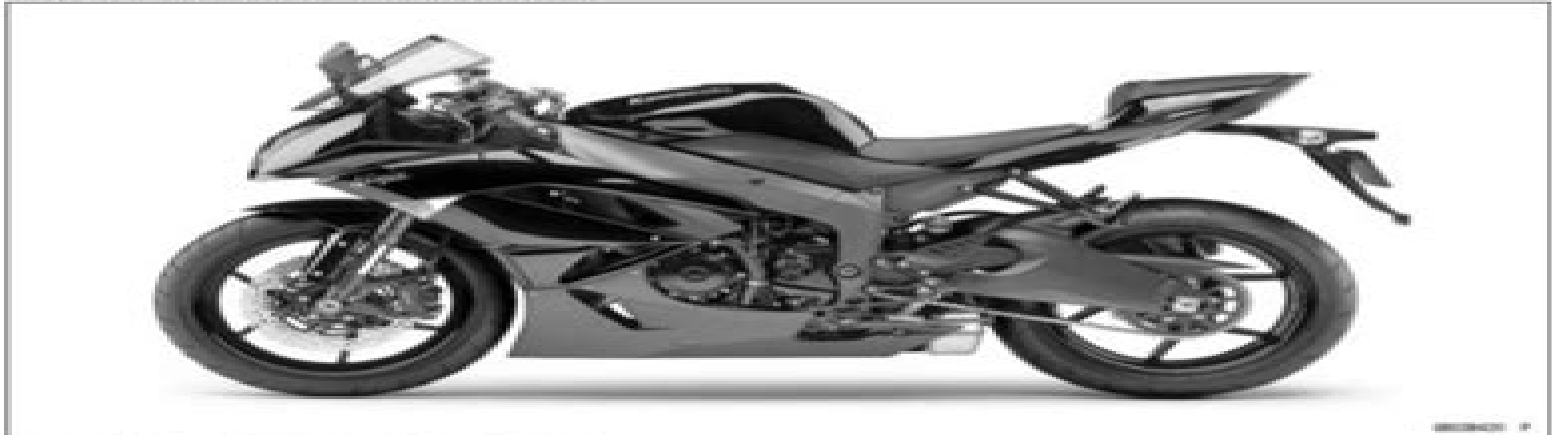
ZX600R9F (EUR Models) Right Side View