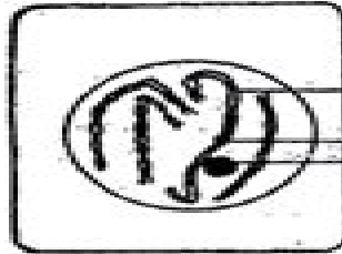
চিত্র : ক

২। নিচের চিত্রগুলো লক্ষ কর এবং প্রশ্নগুলোর উত্তর দাও: