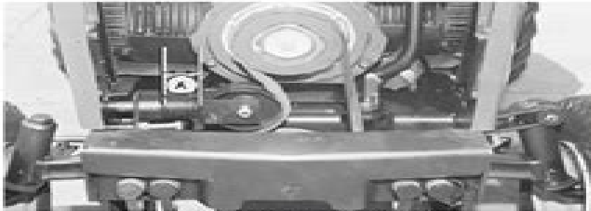
Horizontal Adjuster (Early 420)