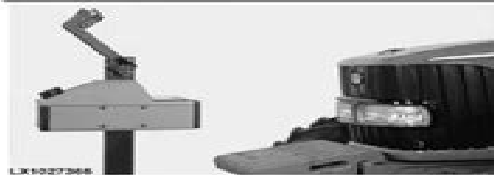
Headlight adjustment using a testing device