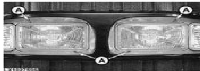
Headlight adjustment using a testing device

To adjust headlights, use a commercial headlight testing device with optical lens system. Test each light individually. Make the required corrections by turning adjusting screws (A).