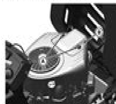
Air cleaner cover (A) and air cleaner element (B)

IMPORTANT: Avoid damage! To prevent engine damage, do not allow any foreign objects to fall into the carburetor air intake.