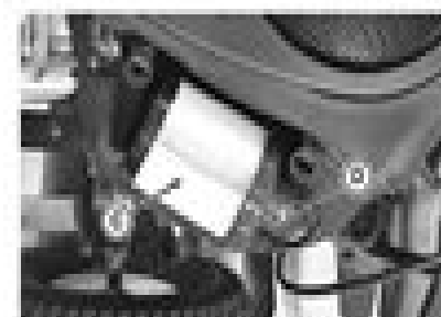
Air cleaner cover (A) and air cleaner element (B)