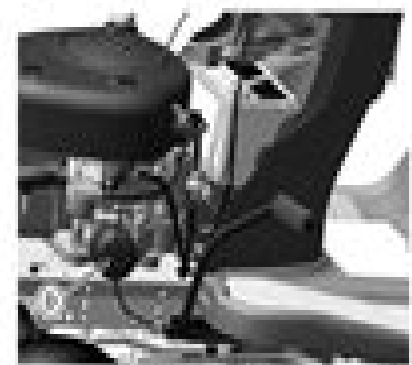
Oil filter cap (C) and oil filter (B)