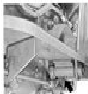
PTO lever grease fitting

When in use, the PTO lever grease fitting should be lubricated every 100 hours. Lubricate with two strokes of grease gun containing SAE multipurpose grease.