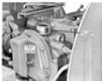
Filter cap and test cock

At the end of each 100 hours of operation, check hydraulic system oil level, by opening test cock on front of housing. If no oil rises out of the test cock, add SAE 10W or SAE 15W-30 oil at filler plug located at the top of housing.