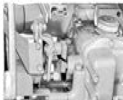
Equalizer lever grease fitting

At the end of 100 hours of operation lubricate the fitting on the equalizer lever near the hydraulic system controls.