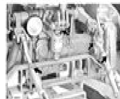
Universal L-Power Bleed grease fitting

At the end of 100 hours of operation, lubricate the fitting on the rear of the load control valve. Also lubricate the three fittings on the right and left lift links. Use two shots of SAE multipurpose grease at each of these fittings.