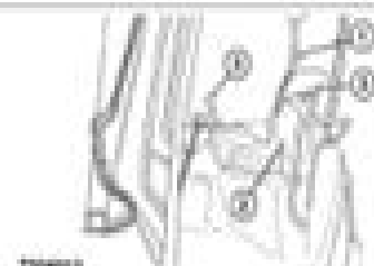
1. Boom Rest