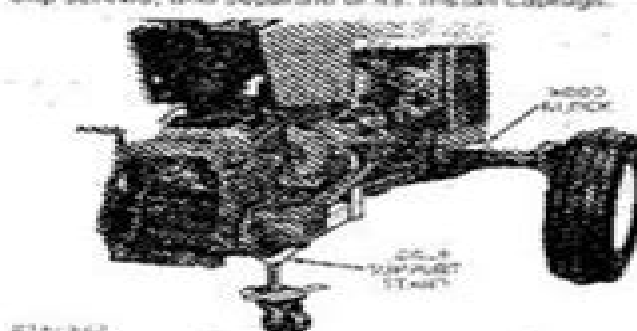
Fig. 6 Clutch Housing Separated From Transmission

Place floor jack under transmission case. Remove the clutch housing-to-transmission case cap screws, and separate units. Install caps.