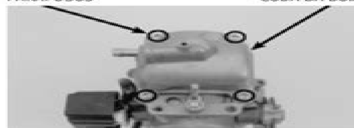
CUBA DA BÓIA