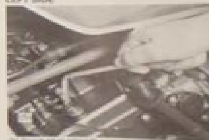
(5) Spark plug wrench