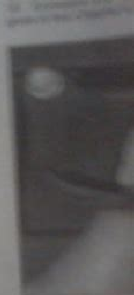
7.18 Tie-rod connector from the locking tab tab (200