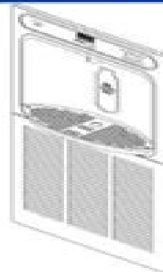
Model LZWSM8K (refrigerated)