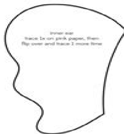
inner ear trace 1x on pink paper, then flip over and trace 1 more time