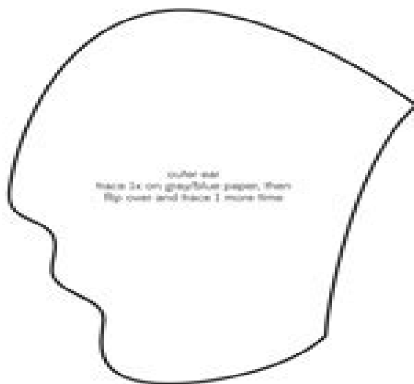
outer ear trace 1x on gray/blue paper, then flip over and trace 1 more time