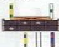
Электропривод правого зеркала (DR2) 0912-303