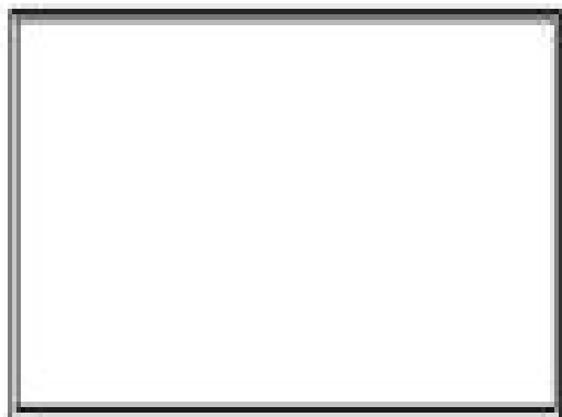
TCL · Roku TV