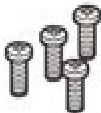
4 x TV stand screws (Phillips) (MSX20mm for 65")