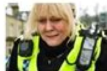
BBC Happy Valley viewers have