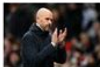
Erik ten Hag 'draws up three-