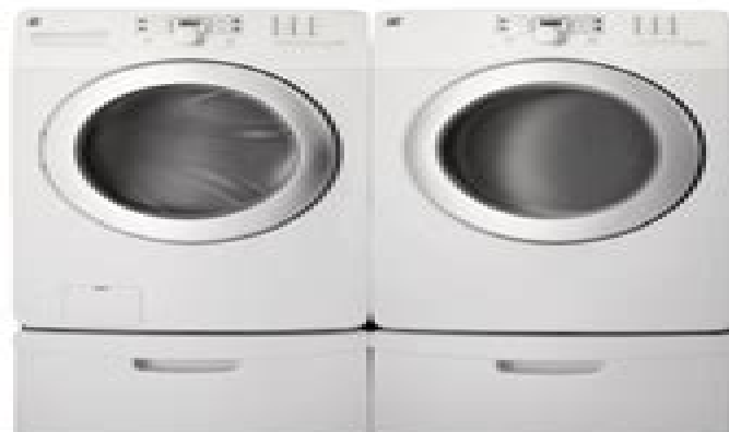
Shown with dryer 26-549032 and optional 15-inch pedestal 26-47252