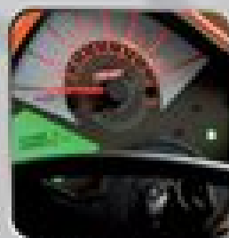
Tablero analógico digital