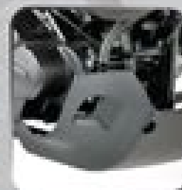
Protector de motor