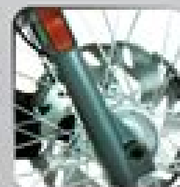
Disco de pétalo delantero y trasero