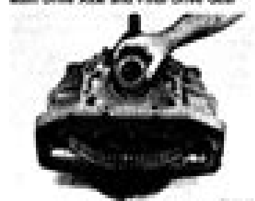
Fig. 14 Pressing a Oil Seal

12. Remove the cap (14, Fig. 6), roller pin, oil seal (2), and washer from the end of the axle shaft, then remove the bearing cone (Fig. 17).