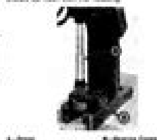
Fig. 9 Pressing a Oil Seal

7. Press the oil seal (2, Fig. 12) into the housing (8) with the top of the seal toward the inside. Use driver tool (A) as shown in Fig. 8. The outer edge of the seal should be flush with the housing.