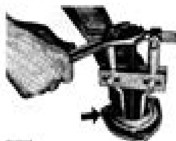
Fig. 4 Pressing a Oil Seal

2. Pull or press off pinion bearing cones (Fig. 10). If there is evidence of wear or damaged parts. Whenever the bearing cone or race is to be replaced, also replace its companion part.