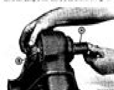
Fig. 11 Pressing a Oil Seal

8. Pack the bearing cones (9, Fig. 14) with John Deere Multi-Purpose Lubricant or an equivalent SAE Multigrade-type grease and press them on the pinion shaft using driver tool (6) as shown in Fig. 14.