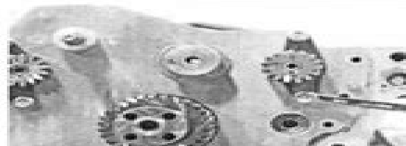
Balancer Shafts and Thrust Plates

Balancer Shaft Specification Thrust Plate Cap Screws—Torque 40 N·m (29.5 lb-ft)