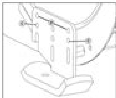
Figure 10-10: Front wheel assembly on side - use position 1 or 2