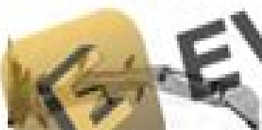
Backhoe Tapered Pins

Check tapered pins. Backhoe tapered pins shown above. See procedure on page 56.