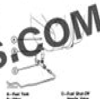
4-Fuel Tank Sump