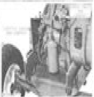
Fig. 10-6 Tractor engine group and truck engine group

When replacing tractor engine with a tractor or truck engine, see the parts list in the parts manual. For more information, see the parts list in the parts manual.