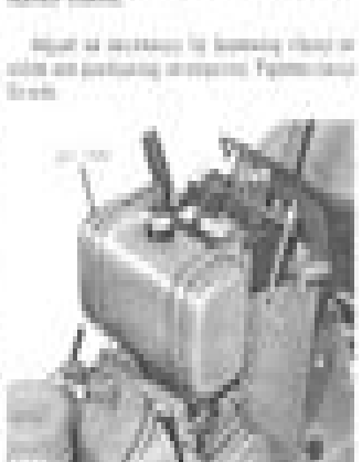
Fig. 10-8 Tractor engine group

When replacing tractor engine with a tractor or truck engine, see the parts list in the parts manual. For more information, see the parts list in the parts manual.