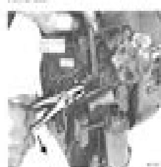
Fig. 10-2 Tractor engine group

These items include all parts and accessories for the tractor engine group. For more information, see the parts list in the parts manual.