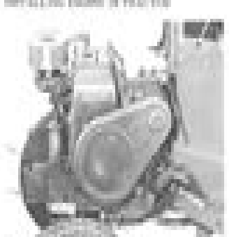
Fig. 10-4 Tractor engine group

Tractor engine is shown and truck engine below in same table in tractor engine.