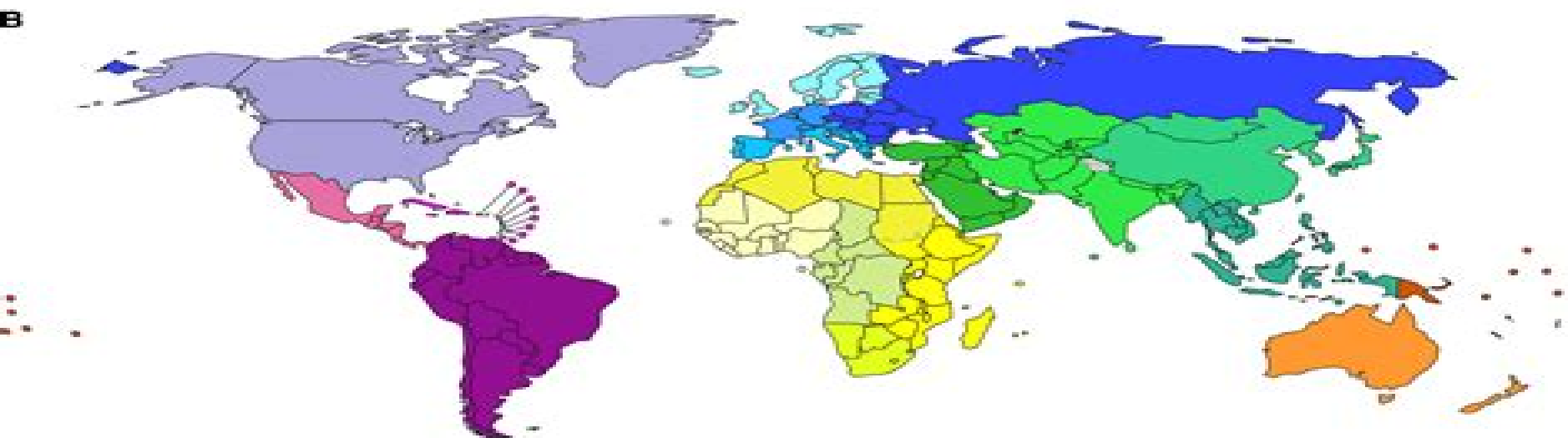
World area (% of population)