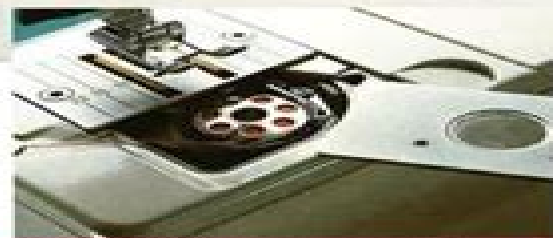
DROP-IN BOBBIN No bobbin case. The bobbin is