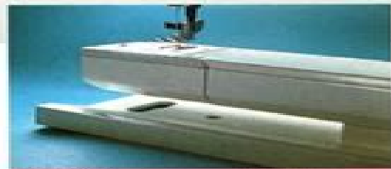
FREE ARM Converts to free arm. I get the standard