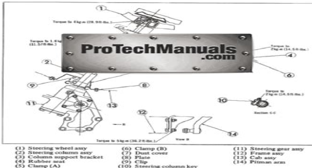
Fig. 2 Steering Wheel and Shaft (RHD Vehicle)