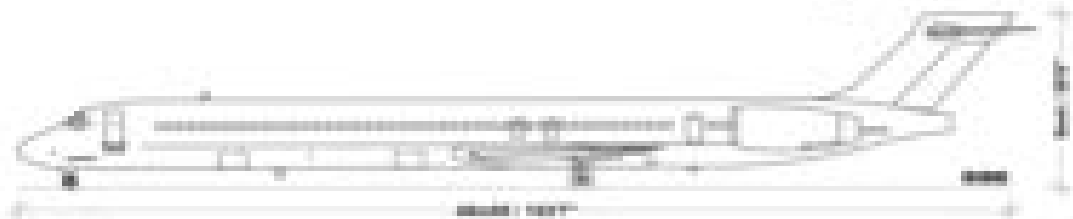
McDonnell Douglas MD90