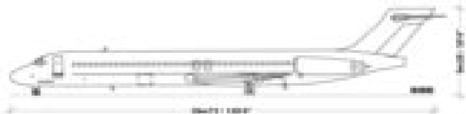
McDonnell Douglas MD87