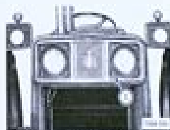
1 - Securing screws

Loosen the adjusting screws, taking care not to lose the springs, then withdraw the rubber housing rearward, complete with sealed beam unit from the upper grille. From the rear of the housing, push out the sealed beam unit.