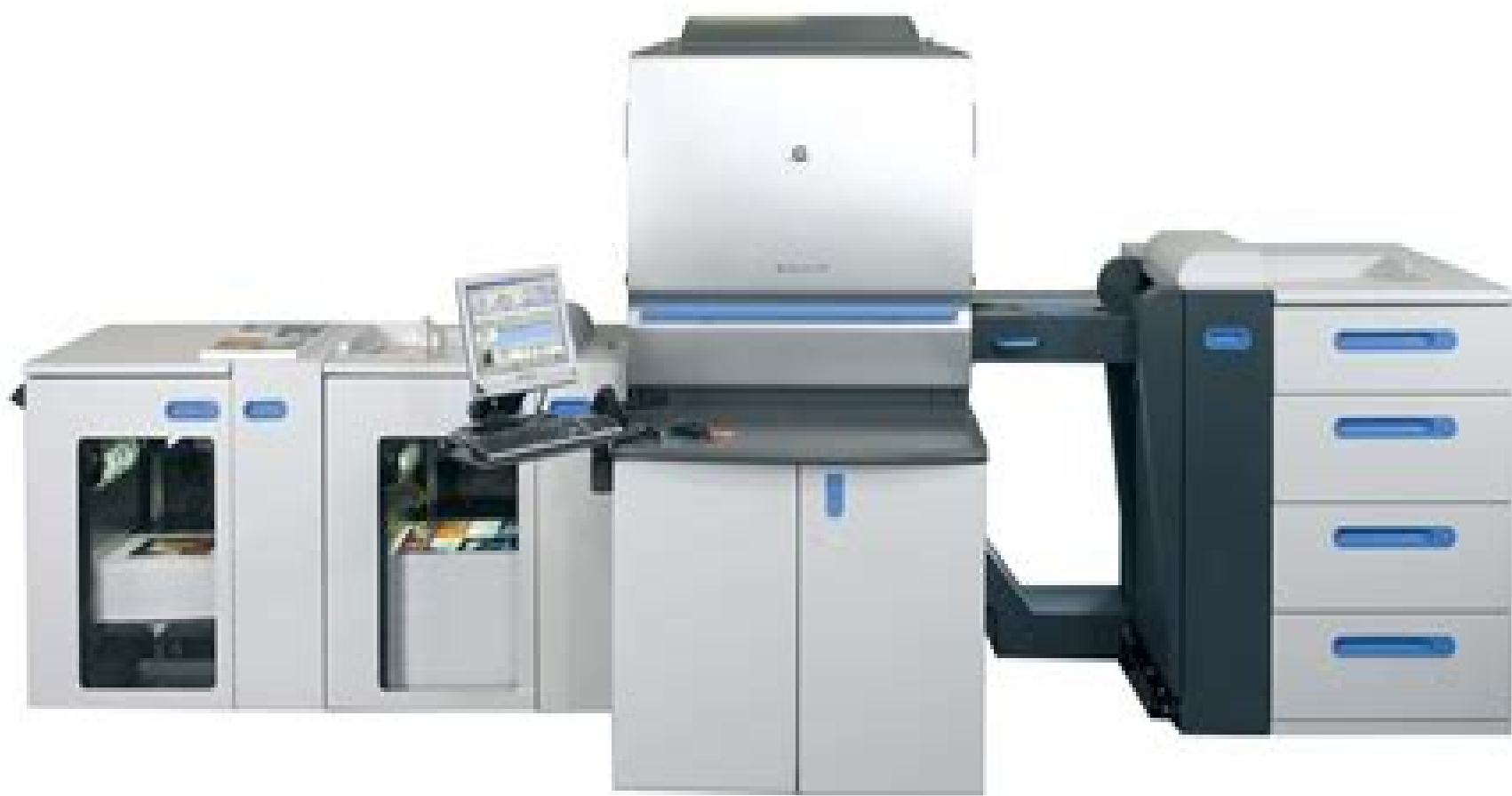
HP Indigo press 5500