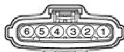
C222 ETC Module