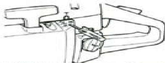
Fig. H40—View showing location of carburetor adjusting points typical of all models. Idle speed screw is at (T), idle mixture screw is at (L) and high speed mixture screw is at (H).

IGNITION. All models are equipped with an electronic breakerless ignition system. Ignition timing is not adjustable and no periodic maintenance is required. Air gap between ignition coil and flywheel should be 0.30 mm (0.012 in.).