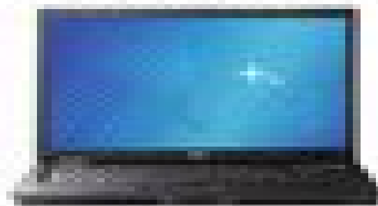
HP Compaq nc6320 Business Notebook PC