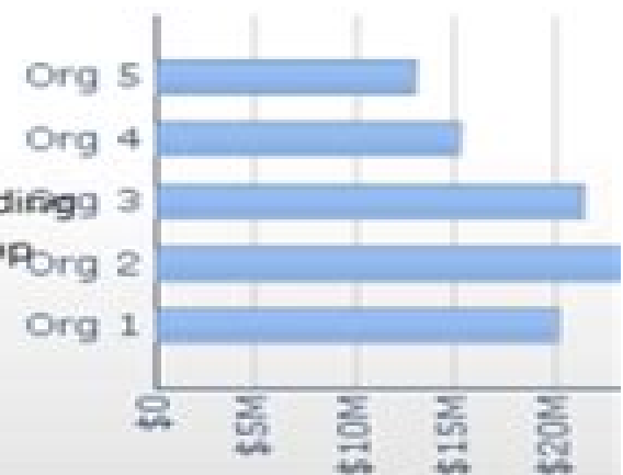
No Year Funding by Organization No Year Funding by Organization

No Year Funding Annual Appropriation Rollover