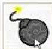
Thick Smoke Bomb