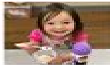
SUMMER CAMPS PAGE 6