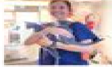
JP HELPING PAWS PAGE 7