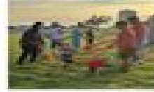
SUPERTOTS & SKYHAWKS, PAGE 17