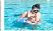
IPRO & THE YMCA PAGE 18-20

JEFFERSON PARISH PARKS & RECREATION DEPARTMENT