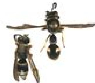
Potter wasps (1 to 2 cm) Smaller, more slender Hooked abdomen and narrow waist