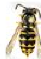
Northern aerial yellowjacket (1 to 2 cm) Bright yellow legs, brighter banding