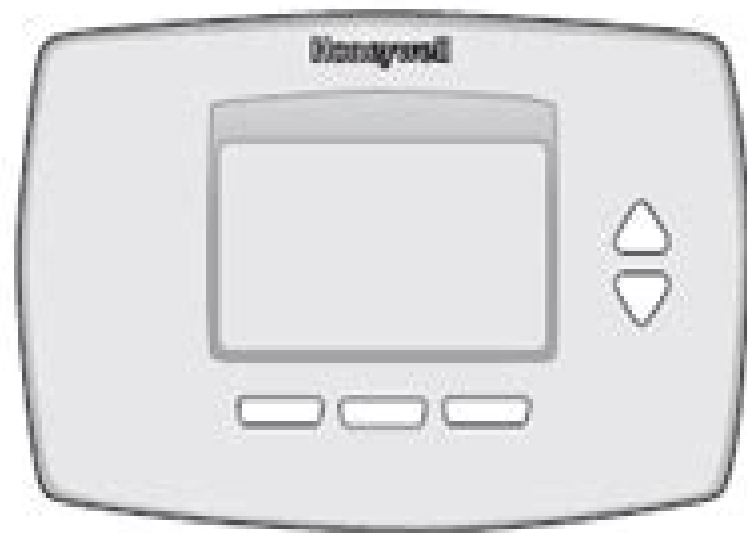
RTH7400/RTH7500 thermostat (wallplate attached to back)