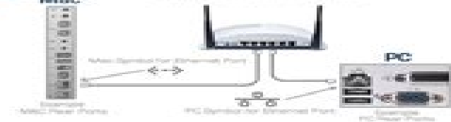
HWRN2 Wireless-300N Router