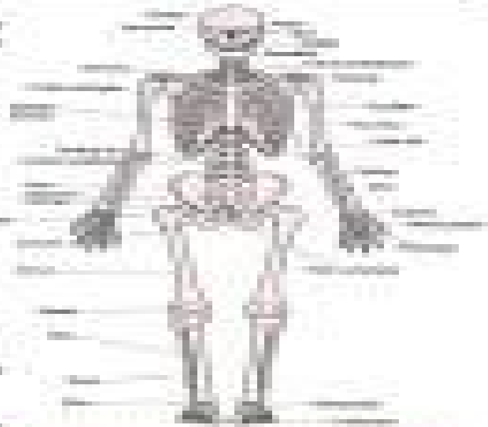
The human skeleton is made up of bones, cartilage, and ligaments.