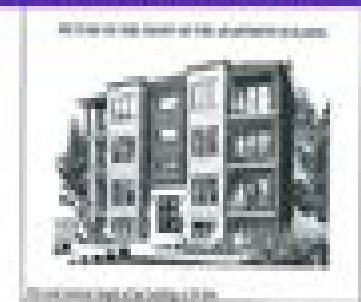
FIGURE 1: A school building with a garden and a playground.

FIGURE 2: A school building with a garden and a playground.