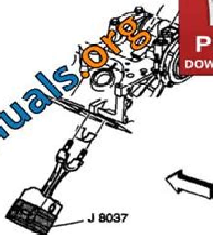
Fig. 9: Identifying Upper & Lower Intake Manifold Components