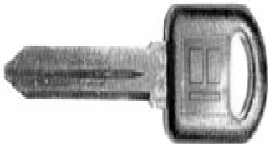
Passkey III (PK3), III + (PK3+) Passkey III (PK3), III + (PK3+)