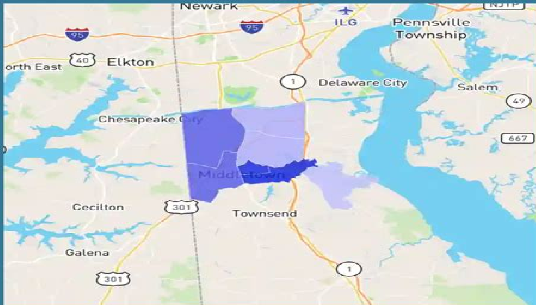
Middletown, DE Crime Map By Neighborhood