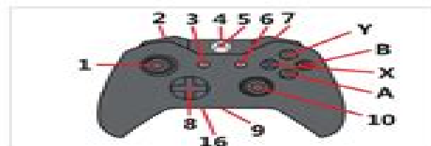
Original Xbox One Wireless Controller