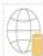
Custom web app

Suggested searches: Assets Business Contacts Employee Inventory Project Sales