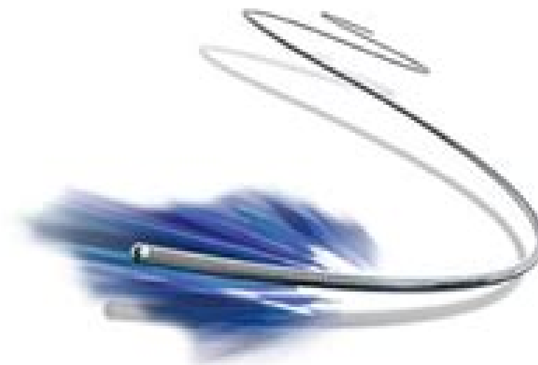
CTO GUIDE WIRE