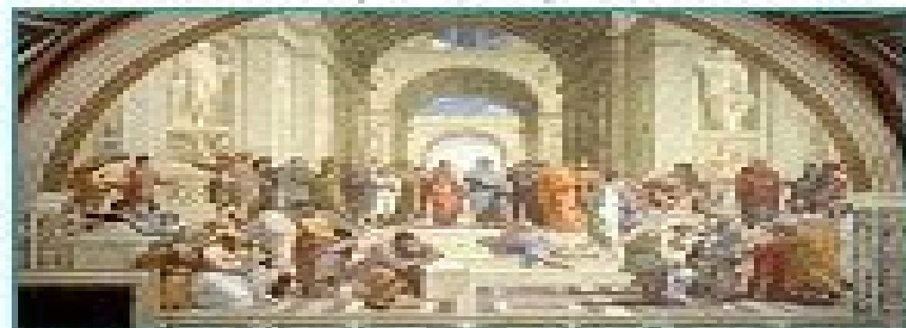
The School of Athens, by Raphael, depicts various philosophers of classical antiquity gathered in one place, with Plato and Aristotle at the center. Raphael modeled Plato after Leonardo da Vinci.

Renaissance artists sought to imitate and surpass the masterpieces of painting. They developed a sense of realism that had not been seen in medieval art by portraying human subjects with realistic proportions. They also employed new techniques, such as linear perspective , which made two-dimensional works of art appear three-dimensional. Renaissance art was heavily influenced by humanistic studies, as evidenced by the prevalence of Greek, Roman, and biblical figures in paintings, sculpture, and architecture.