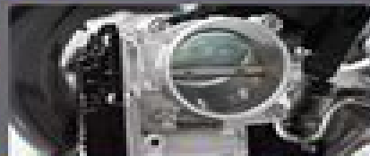
6. Throttle Adaptation