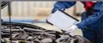
5. BMS Reset