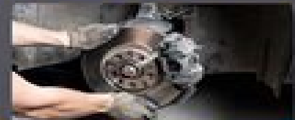
8. ABS Bleeding