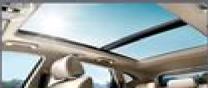
9. Sunroof Reset