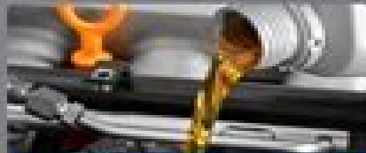
1. Oil Reset