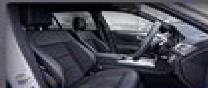
7. Seat Calibration