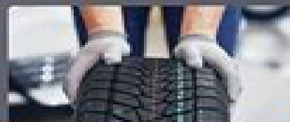
10. Tire Resets