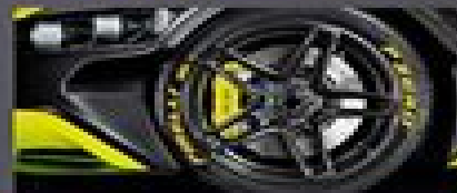
11. Brake Resets