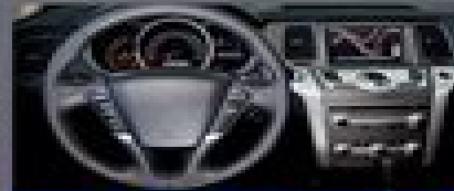
3. SAS Reset