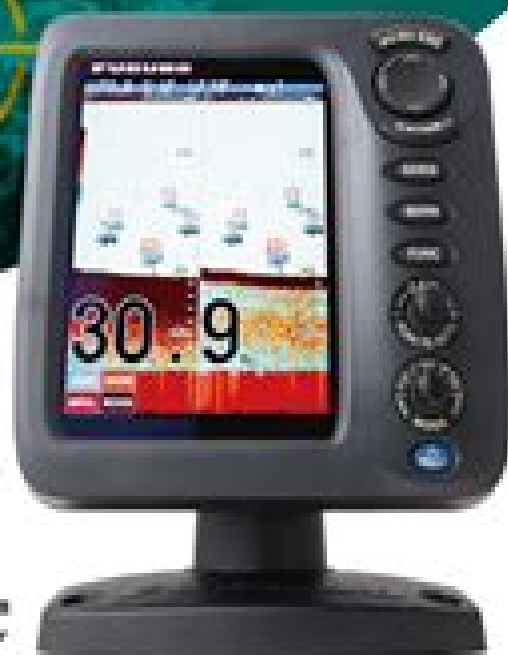
5.1" Color LCD FISH FINDER — FCV-627